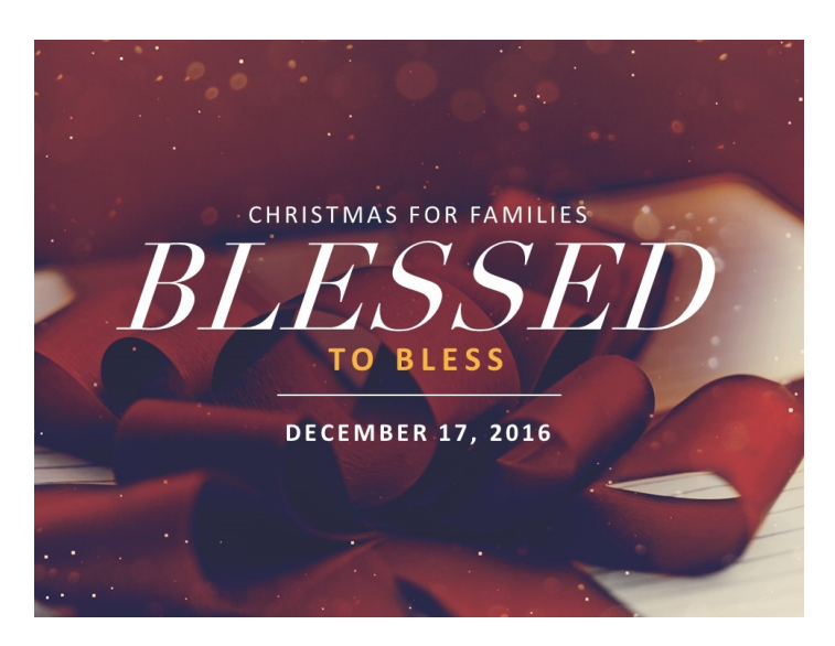
December 17th 1-3 pm